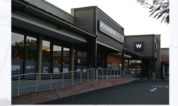
WOOLWORTHS, KEMPTON PARK

AN A-GRADE WAREHOUSE WITH MODERN OFFICE SPACE BUILT ON A RAISED SOIL PLATFORM WITH LOFFELSTEIN RETAINING WALLS ON THREE SIDES. THIS ANIMAL FEED DISTRIBUTION WAREHOUSE