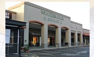
WOODBRIIDGE SQUARE, GLEN MARAIS KEMPTON PARK

ALL CIVIL WORK INCLUDING BULK EARTHWORKS, LAYER WORKS, CONCRETE HARDSTANDS PAVING AND STORM WATER TO THIS BRAND NEW MODERN WAREHOUSE SUITED FOR LOGISTICAL PURPOSES.