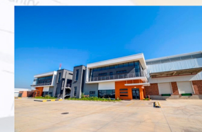
SA CENTRES NEW WAREHOUSE, RIVERSIDE GARDENS, NELSPRUIT

CIVIL WORKS FOR THE NEW BMW DEALERSHIP IN EASTVIEW EMALAHLENI.