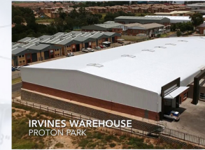
IRVINE'S WAREHOUSE PROTON PARK

ALL CIVIL WORK FOR THIS NEW SHOWROOM, PARTS SALES, WORKSHOPS AND TRAINING CENTRE. WORK INCLUDES BULK EARTH WORKS, LAYER WORKS KERBING AND PAVING.