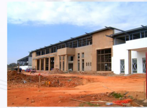
HYUNDAI TRUCK CENTRE, BOKSBURG,

WAREHOUSE WITH HIGH TOLERANCE FLOORS INCLUDING AN ADMINISTRATION BLOCK.