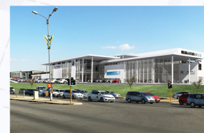
BMW, EASTVIEW EMALAHLENI

WAREHOUSE WITH HIGH TOLERANCE FLOORS INCLUDING AN ADMINISTRATION BLOCK.